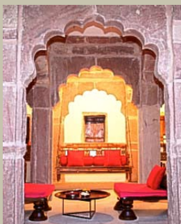
Remote: Ranvas Haveli was created for queens

Regal tip: Also inside the fort is the Ranvas Haveli, a beautiful 27-room hotel made up of 18th-century 'havelis' (mansions) built for the queens of the Maharaja of Jodhpur. Each has its own courtyard and veranda. Paradise.