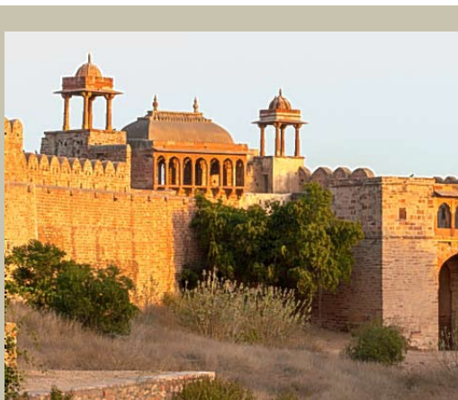
Fort for the day: The Nagaur fort is out of the way

Regal tip: Sip cocktails at sunset from the infinity pool on the rooftop of the Leela Palace Hotel.