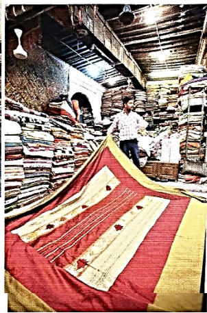
Clockwise from top left: Raas Jodhpur. Maharani Textiles & Handicrafts. The opening concert at Jodhpur RIFF, 2011. Bottom: a Bishnoi potter