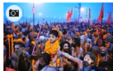
The Maha Kumbh Mela