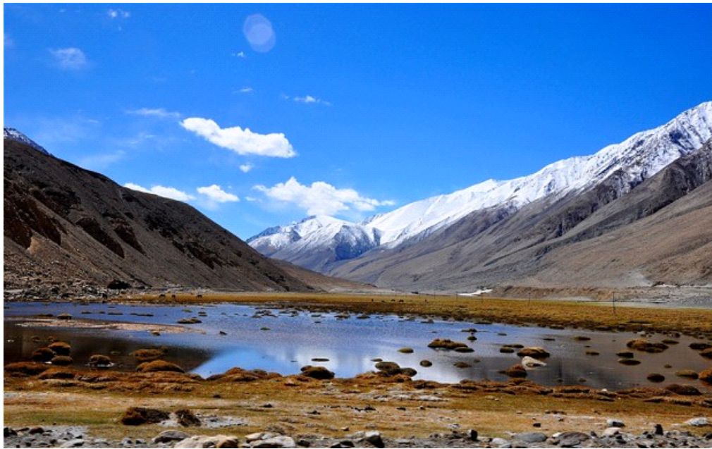
This mountainous area is so beautiful it has been called "the Switzerland of Asia"

Since the Foreign Office warning was partially lifted a little more than a year ago, Kashmir is once again on the radar of British travellers – and with good reason