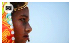
Pushkar Camel Fair