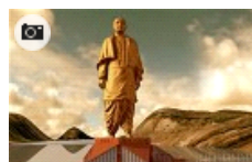
World's tallest statues