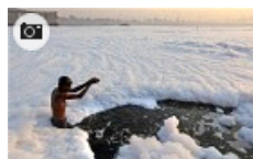
Karthik Purnima festival