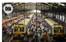
Rail travel in India