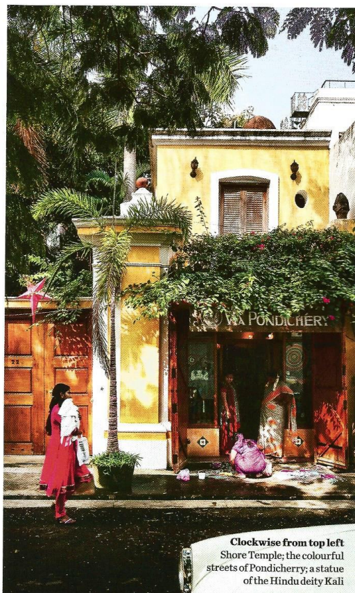
Clockwise from top left Shore Temple; the colourful streets of Pondicherry; a statue of the Hindu deity Kali